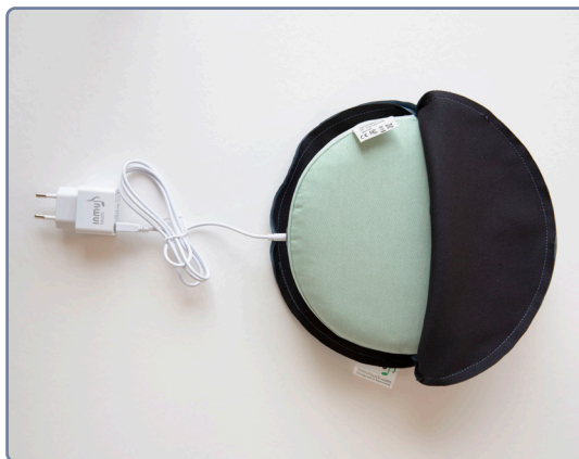
Here you see the C-fold and the A-fold dismantled while the inmu is being charged.