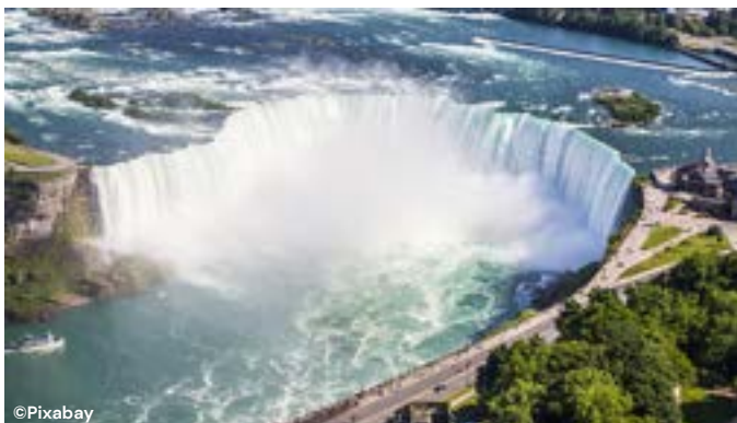
N I A G A R A F A L L S