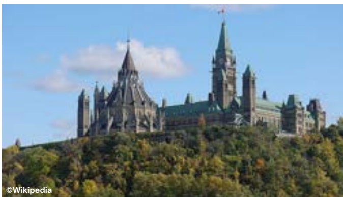
P A R L I A M E N T H I L L