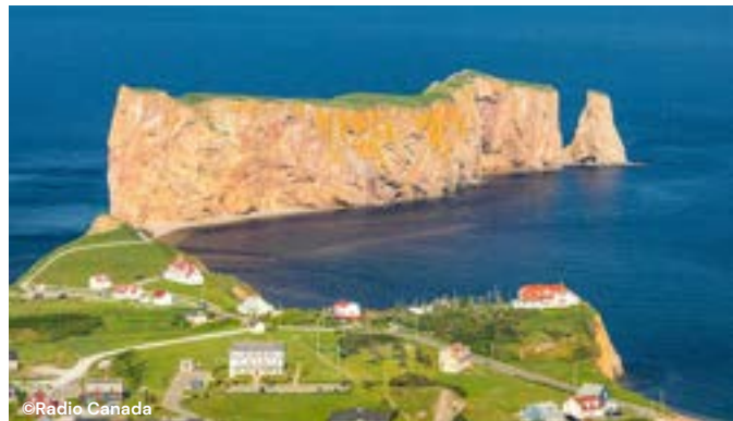
R O C H ER P E R C É