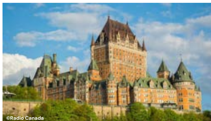
C H A T E A U F R O N T E N A C