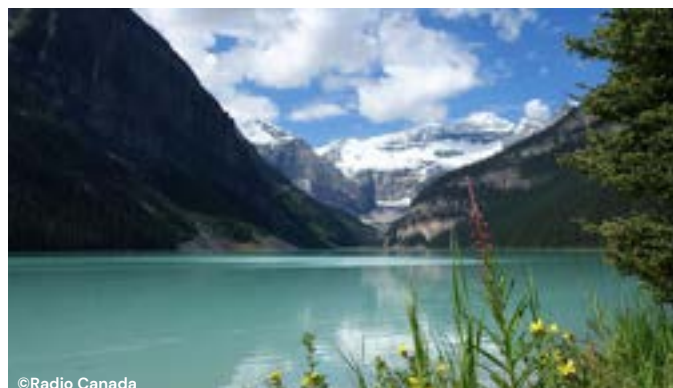
L A K E L O U I S E