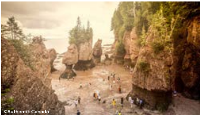
B A Y of F U N D Y

Can you identify some of these famous Canadian places? With the help of the pictures and letters, name these amazing places!